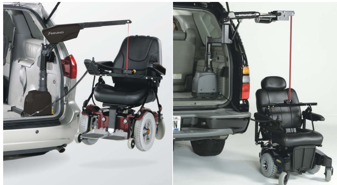
The Carolift 6000 has a lift capacity of 181 kg.

The Carolift model 6900 has a telescoping hoist head to pass through narrow door openings or to bypass wide bumpers.