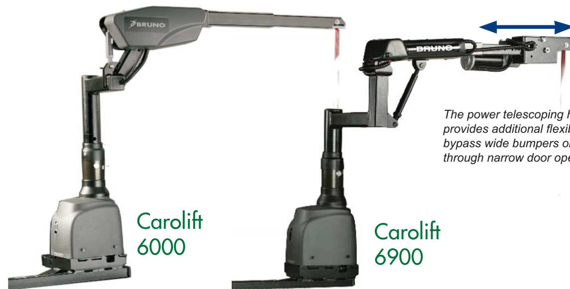
The power telescoping hoist head provides additional flexibility to bypass wide bumpers or to pass through narrow door openings.