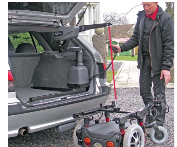
The Carolift 6000 is loading a Carony Go wheel unit in a Peugeot 406 with a sloping rear door design.