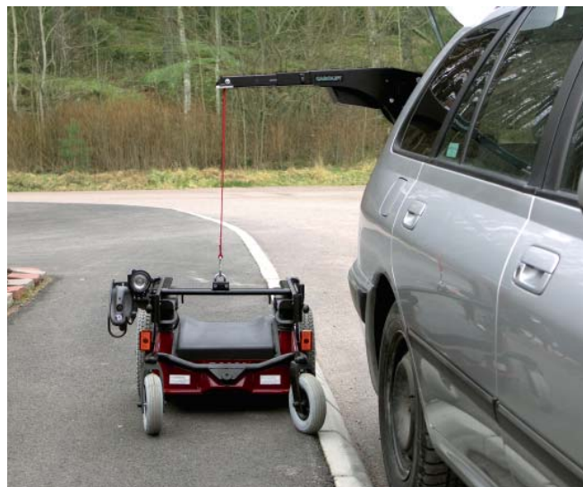
Carolift 6000 picks up a Carony Go wheel unit from the pavement.

The hoist arm of Carolift 6000/6900 has an off-set design (like two "elbows") which enables loading from the side of the vehicle. This means you can keep the wheelchair placed on the pavement thus not needing to descend to street level.